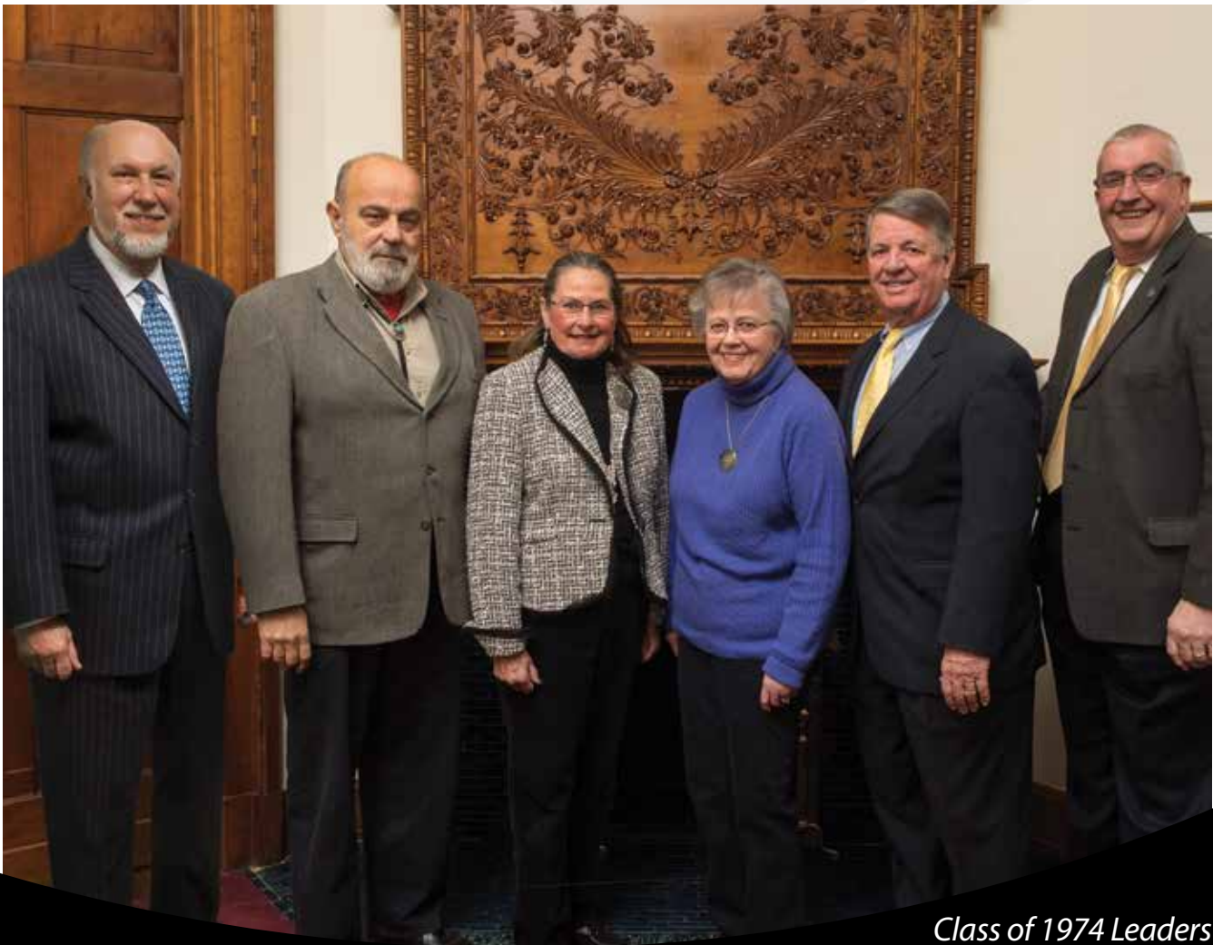
Class of 1974 Leaders

The following list includes all annual gifts made to the College of Law by alumni in the calendar year 2014. Your support is very much appreciated.